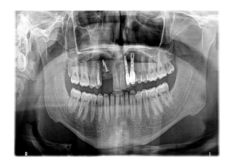
Exactly after bone graft placement